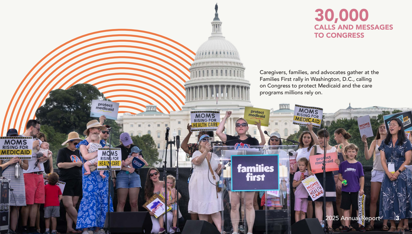
Caregivers, families, and advocates gather at the Families First rally in Washington, D.C., calling on Congress to protect Medicaid and the care programs millions rely on.