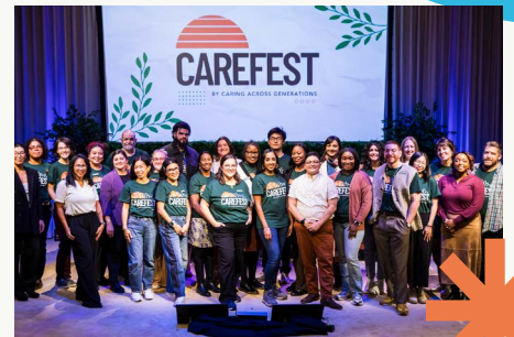
Caring Across Generations staff helped bring the vision of CareFest to life, creating a space where caregivers, storytellers, advocates, and cultural leaders could come together to explore the future of care and the movement needed to achieve it.