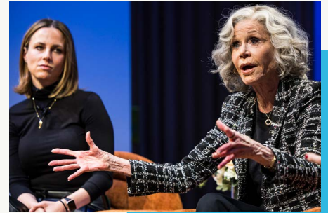
Jane Fonda joined CareFest for a powerful conversation titled On Hope , inspiring bold thinking about the future of care and the movement needed to build a more caring, equitable future for all.

Hosted “Covering Care” Media Salons in D.C. and New York, convening 150 journalists, influencers, digital content creators and storytellers across care-related beats to build a growing network of media makers committed to covering care—and generating concrete story leads, shared framing, and new reporting connections that carried the conversation beyond the room and prepared the news media field to keep care on the national agenda.